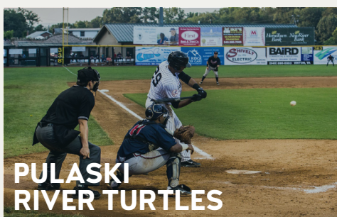
PULASKI RIVER TURTLES

You can usually find game nights at Calfee Park packed to the brim with loyal NRV residents cheering on the Pulaski River Turtles, a summer collegiate baseball team in the Appalachian League in partnership with MLB and USA Baseball. The River Turtles are a source of pride for Pulaski and it's impossible not to have fun at Calfee Park.