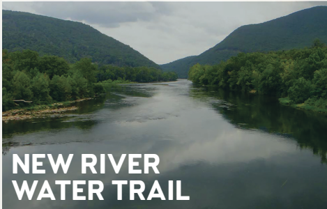
NEW RIVER WATER TRAIL

Giles County has made an effort to make the New River more accessible than ever. Tons of boat launches and docks are available for paddlers, boaters, and floaters of any skill level. When you're ready for your next adventure, look to the New River Water Trail.